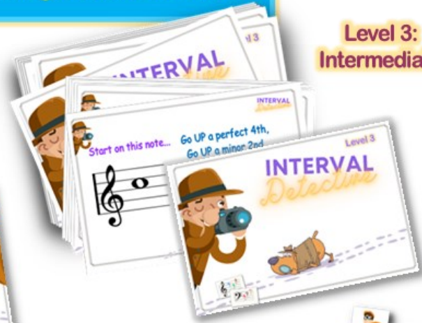
Level 3: Intermediate