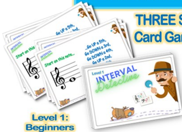
Level 1: Beginners