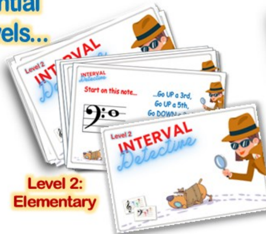
Level 2: Elementary